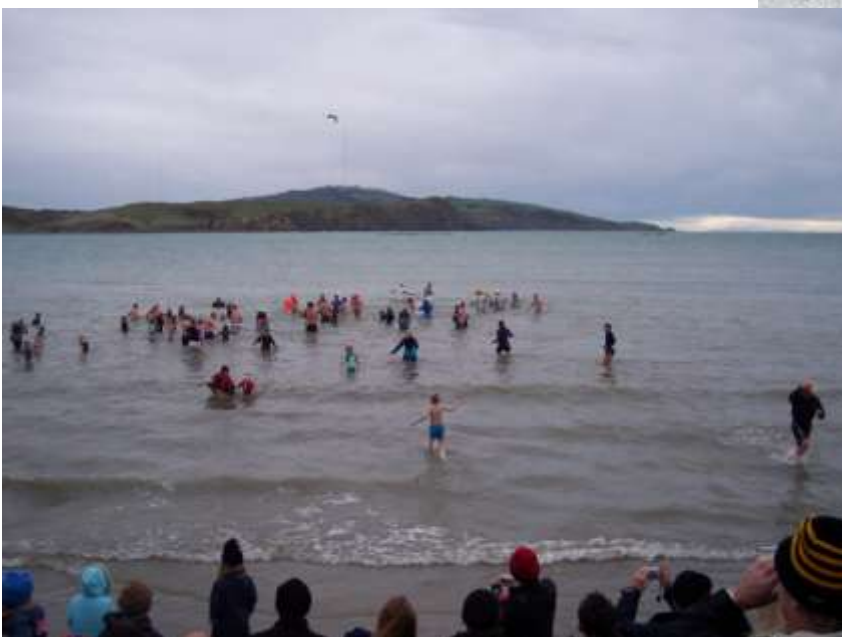
Mid winter dip-Plimmerton Volunteer Fire Brigade