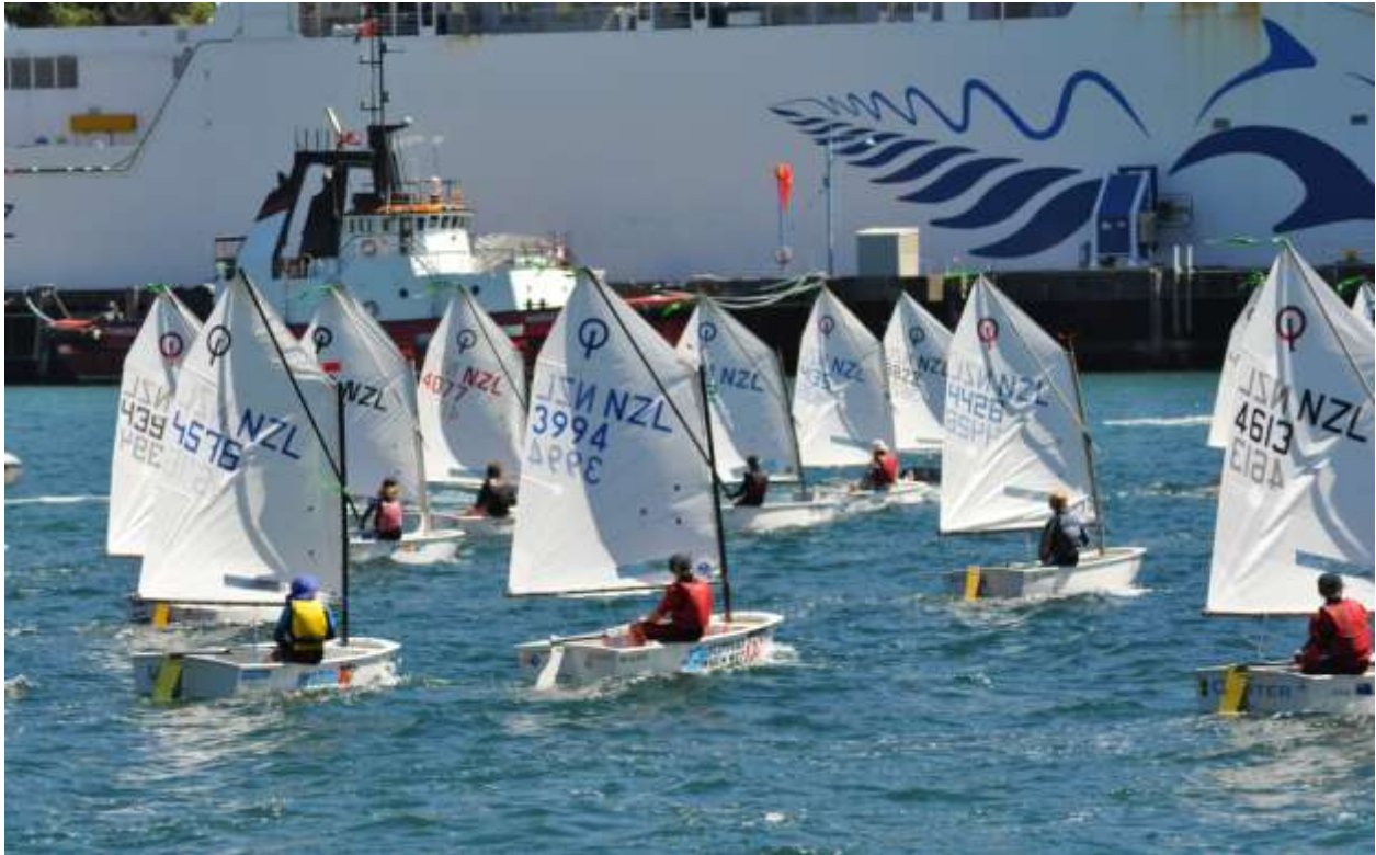
Racing. Green Fleet.

The club picnic at Shelly Bay was well attended and a fun day with lots of families attending.