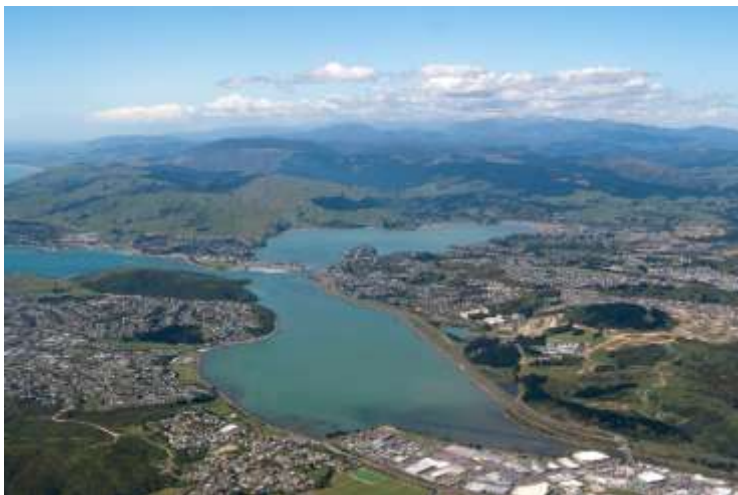
Porirua_Harbour