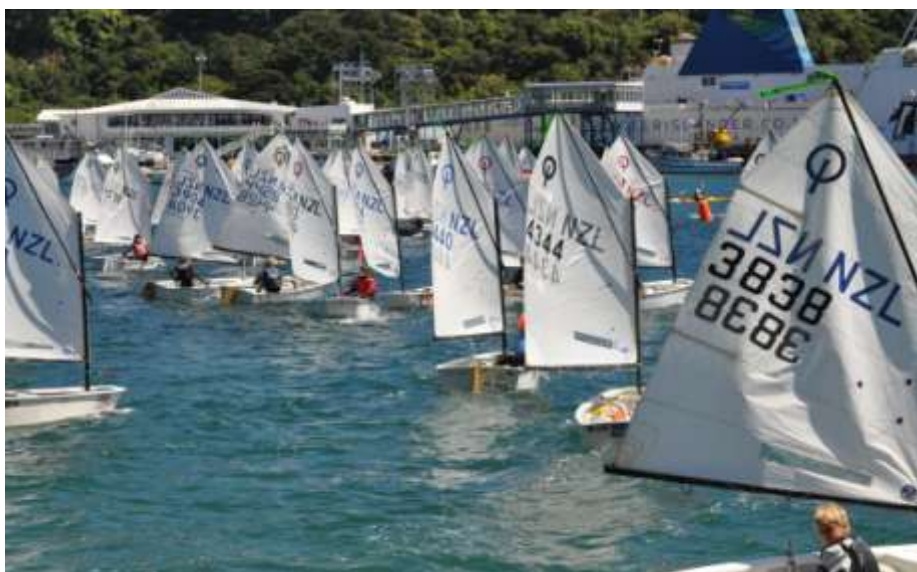
Getting ready for a start. Green Fleet

This year we have introduced our Open & Green Fleet sailors to Sunday morning club racing which is turning out to be very successful and we currently have a series running along side of the senior fleet. Specialised coaching clinics are happening with Paramata sailors. Learn To Sail is currently running on Mondays.