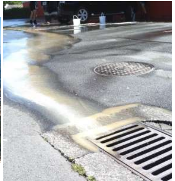
Porirua Harbour - storm water-runoff-carwash by PCC