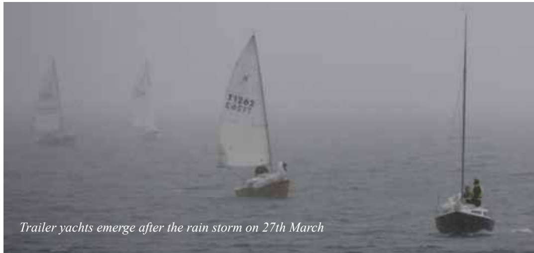
Trailer yachts emerge after the rain storm on 27th March