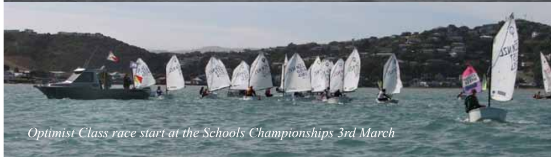
Optimist Class race start at the Schools Championships 3rd March