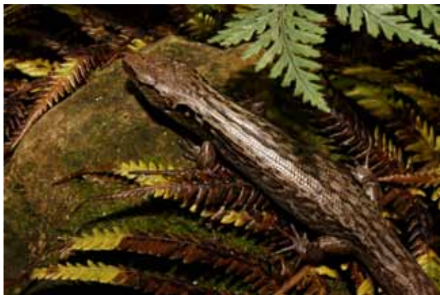
A McGregor's skink on Mana Island