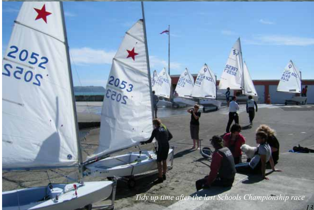
Tidy up time after the last Schools Championship race